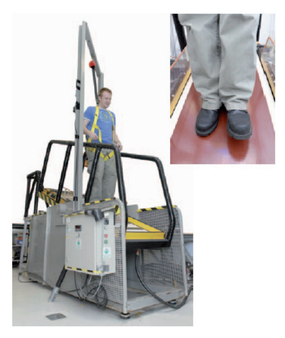
Figure 4 The UKSRG ramp CoF test

The HSL ramp test (Figure 4) is designed to simulate the conditions commonly encountered in typical workplace slip accidents. This uses clean water as the contaminant and footwear with a standardised soling material. Barefoot testing may also be undertaken. The test method involves using test subjects who walk forwards and backwards over a contaminated flooring sample. The inclination of the sample is increased gradually until the test subject slips. The average angle of inclination at which slip occurs is used to calculate the CoF of the flooring. The CoF measured relates to the flooring used on a level surface. It is possible to assess bespoke combinations of footwear, flooring and contamination, relating to specific environments, using this method. HSL also uses the ramp to assess the slipperiness of footwear.