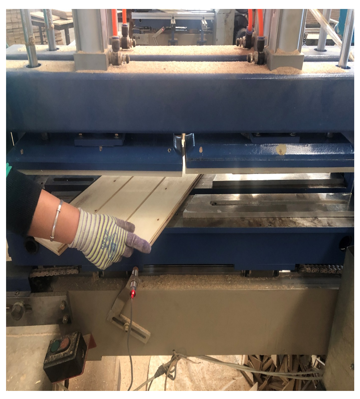
CLICK THE IMAGE ABOVE TO WATCH THE VIDEO.