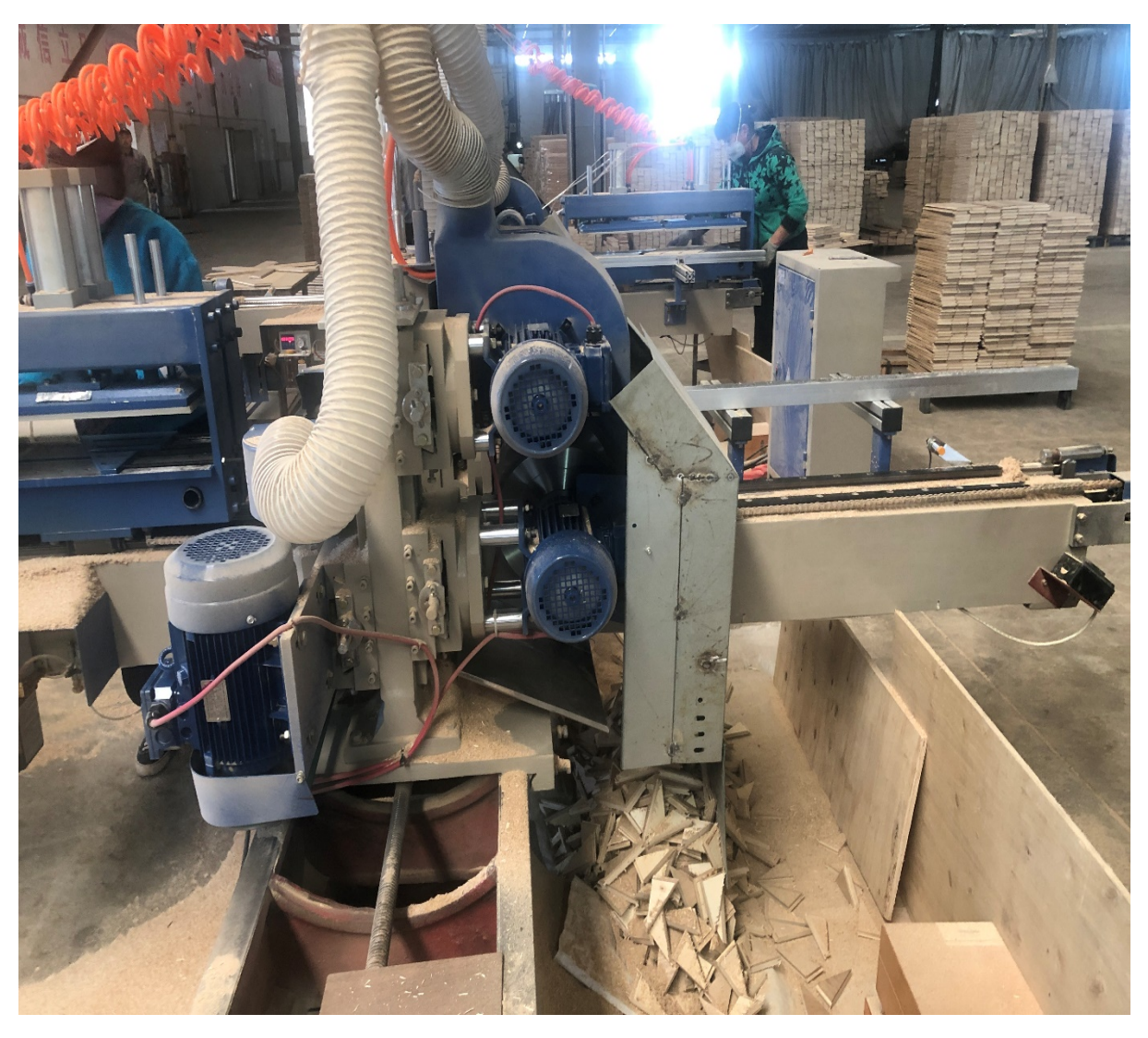
As you can see there is a lot of waste when making chevron which is why it is more expensive than herringbone.