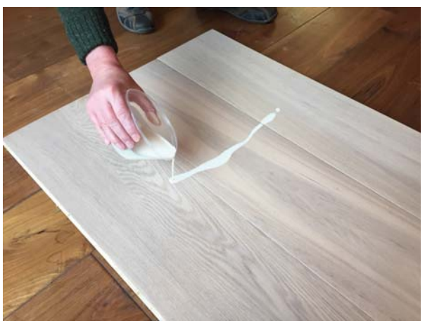
Use a small container and apply the oil very sparingly