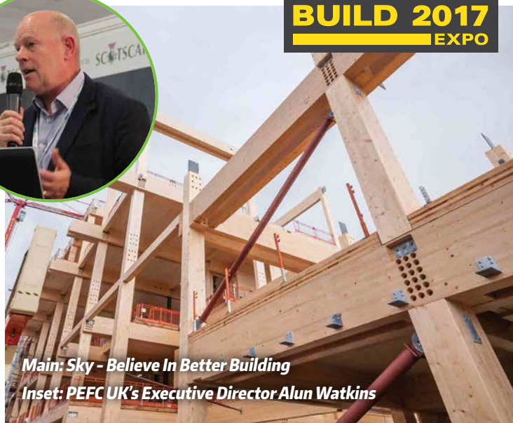
Main: Sky - Believe In Better Building